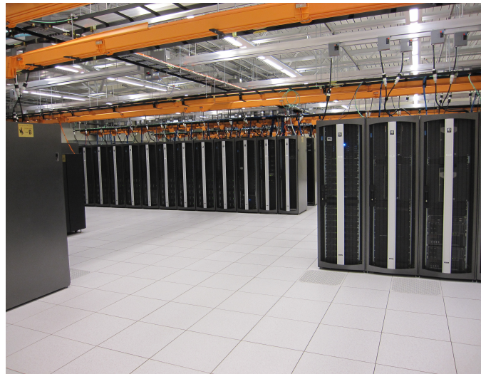
University of Wyoming ITC Data Center

“Another great benefit of the system is the ability to view battery status remotely and for users to receive email and text notifications if an issue arises. We can also keep a history file of our strings and watch for trends that indicate degraded capacity or poor connections without physically entering the cabinets.